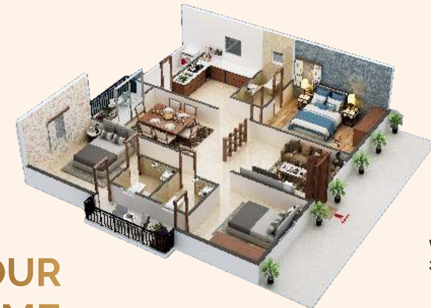
West Facing 3 BHK- 1800 sft