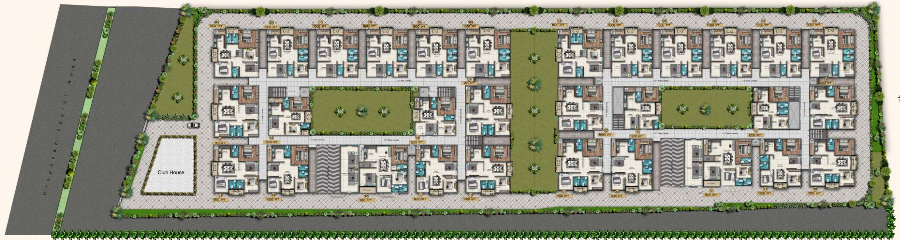
GROUND FLOOR - BLOCK A