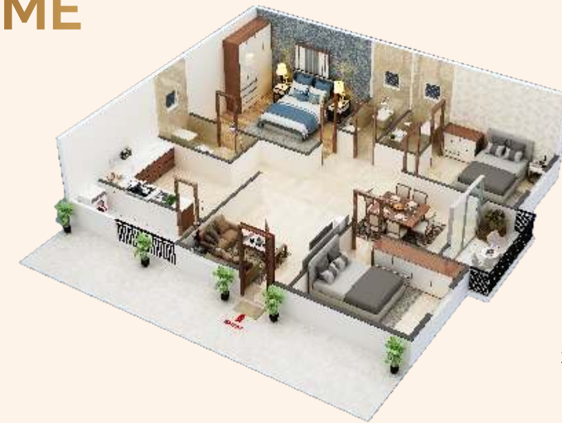
East Facing 2 BHK- 1200 sft