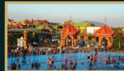
Haailand (Kaza, Mangalagiri)