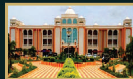
Acharya Nagarjuna University