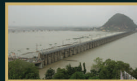
Prakasam Barrage (Vijayawada)